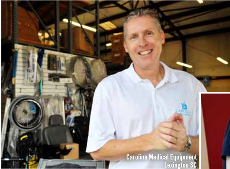
Carolina Medical Equipment Lexington SC