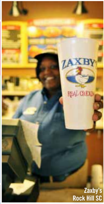
Zaxby's Rock Hill SC